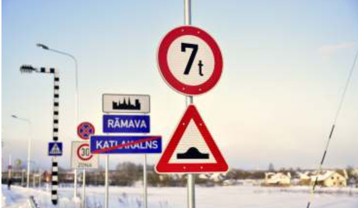
TRAFFIC ROAD SIGNS