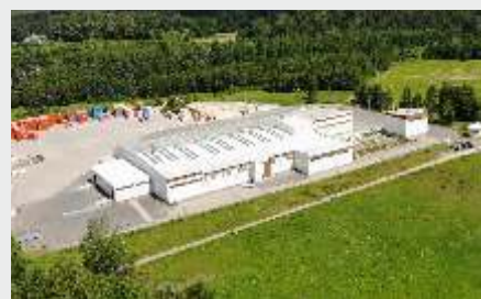
Factory in Salaspils county, Saulkalne