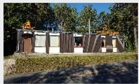
Traffic sign branch in Cesis, Gaujas str. 70