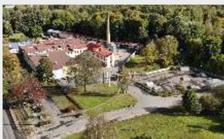
Factory in Riga, Bauskas street 143