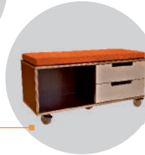
Filing cabinet on wheels Size, mm (HxLxD): 400x1000x400