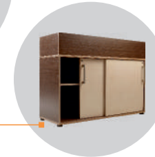
Small filing cabinet Size, mm (HxLxD): 856x1200x400mm