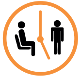
Recommended position during the day

It is not recommended for a person to spend a working day in one fixed sitting position.