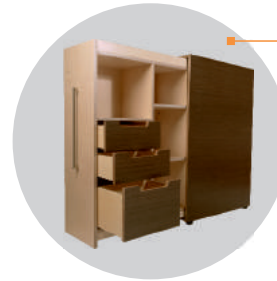
Filing cabinet Size, mm (HxLxD): 1168x800x382