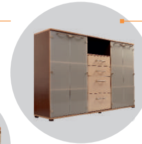
Wall-unit Size, mm (HxLxD): 1150x1800x400